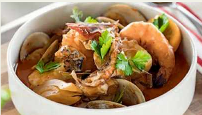
Cioppino with OLD BAY® Seasoning

There are only two things you need to know about OLD BAY® seasoning—it's great on seafood and it's great on everything else.