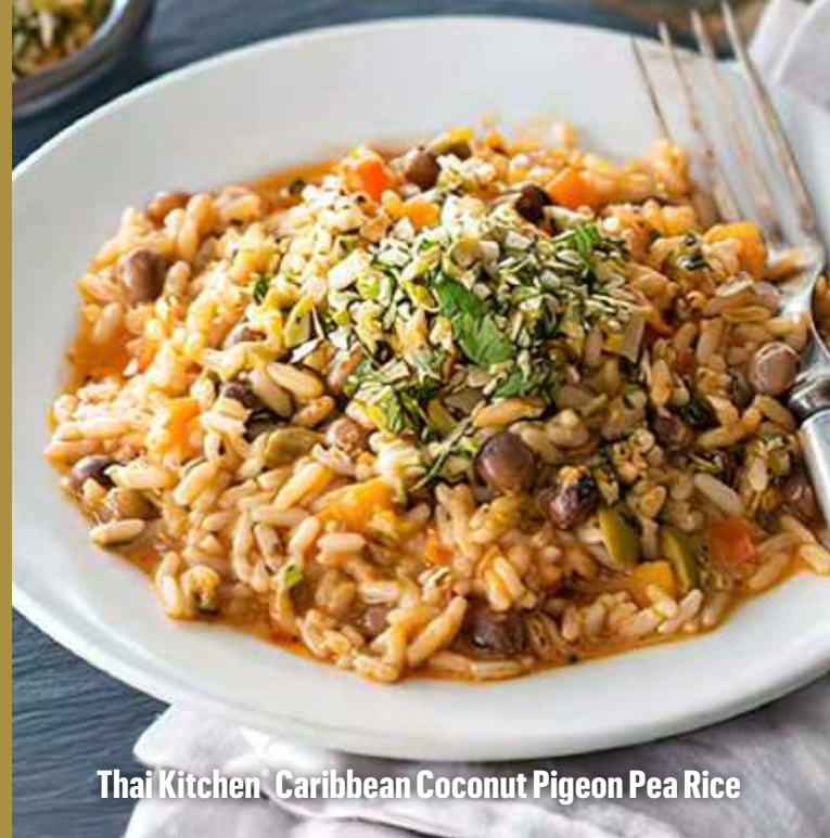
Thai Kitchen® Caribbean Coconut Pigeon Pea Rice

The flavours of Asia are today's kitchen essentials. Thai Kitchen® brings the aromatic essences, craved flavours and abundant textures of Thai food to any menu—all with the high-quality authenticity you expect from McCormick.