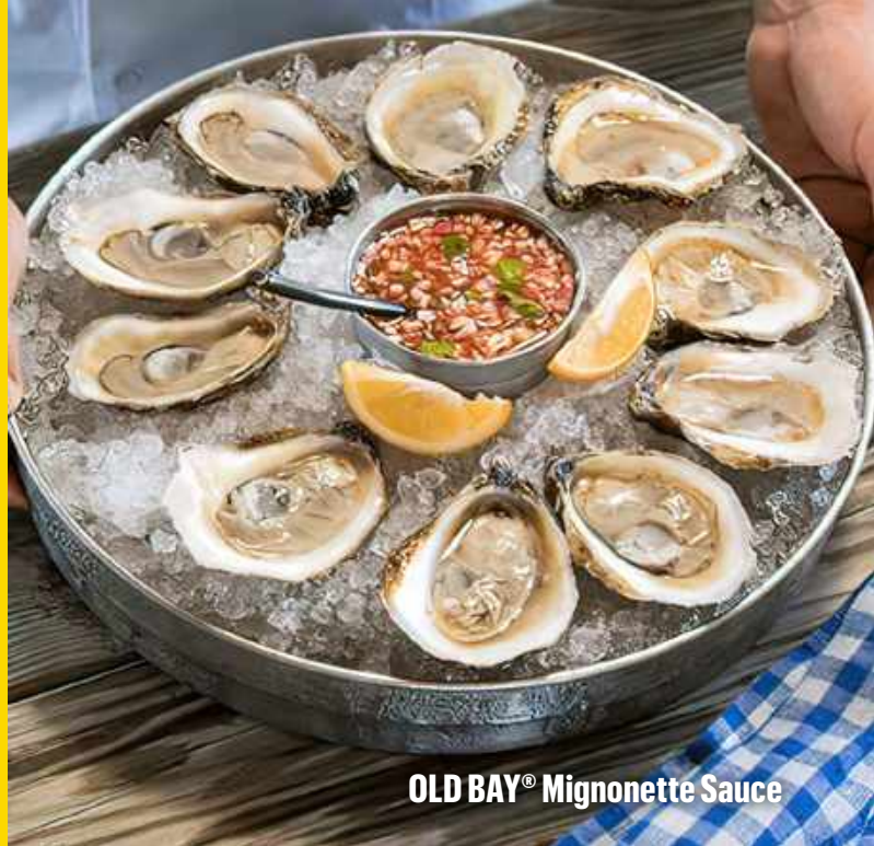
OLD BAY® Mignonette Sauce

For decades, OLD BAY® has been nestled between the salt and pepper in the Chesapeake Bay region of Maryland. Now people all over Canada are sprinkling and shaking it on salads, chicken wings, fries, and more!