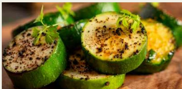
Grilled Green Zucchini Medallions

This premium blend of spices, herbs and vegetables enhances the delicious flavour of vegetables and vegetable dishes.