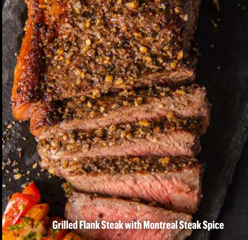
Grilled Flank Steak with Montreal Steak Spice

Club House La Grille® on-trend seasoning blends deliver mouth-watering flavour and eye-catching visual appeal to any menu – with or without the grill. Try them in marinades, as recipe ingredients or simply sprinkle onto any dish before serving for bold flavours customers crave.