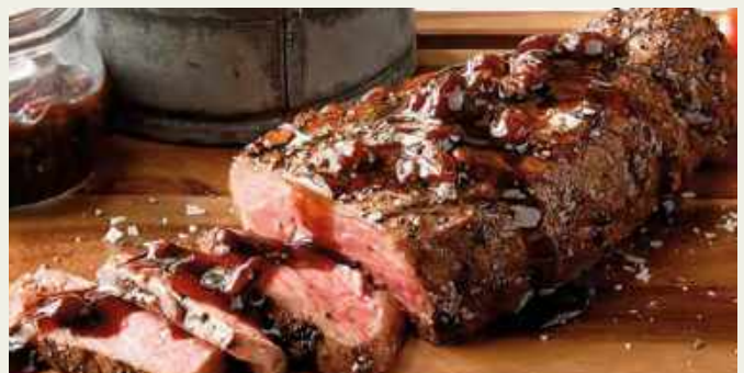
Hot & Spicy Worcestershire Steak Sauce

For more on-trend recipes featuring French's® products, visit ClubHouseForChefs.ca/en-ca/Products/Frenchs . Find the full portfolio of French's products on page 28.