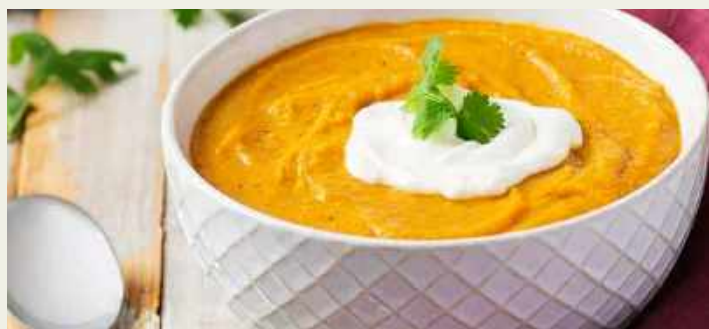
Lawry's® Cajun Sweet Potato Soup

Cajun Seasoning is a bold and sassy seasoning with paprika, red pepper, garlic, onion and herbs that gives you flavour reminiscent of Louisiana cooking.