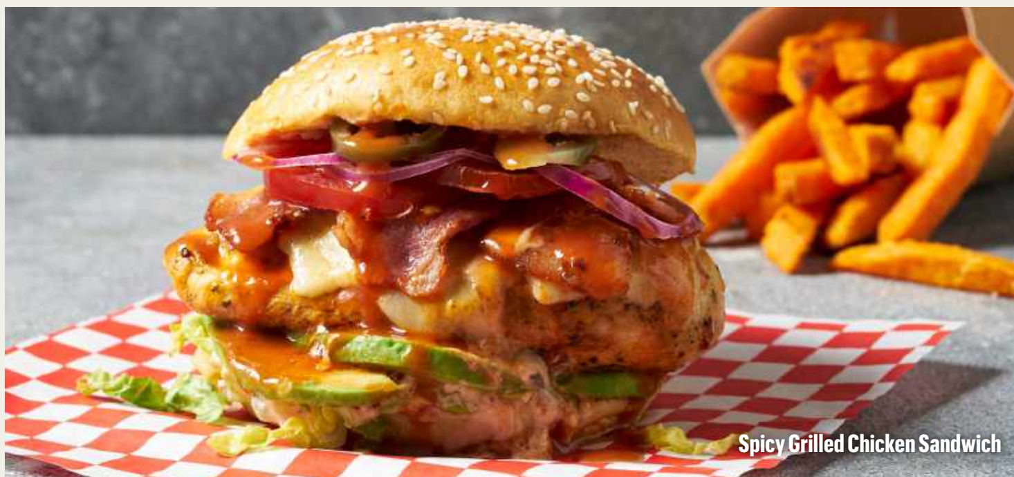
Spicy Grilled Chicken Sandwich