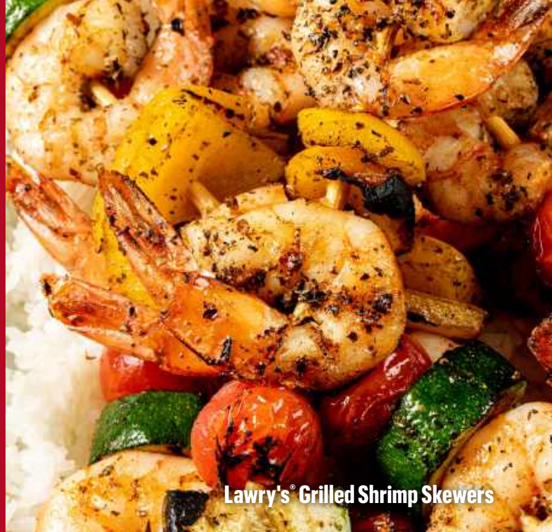
Lawry's® Grilled Shrimp Skewers

There's no question about it; consumers are seeking new and exciting flavours more than ever before when dining out. While you may have streamlined your menu over this past year, the flavours and ingredients you choose shouldn't take a back seat. Our array of high-quality spices, herbs, and seasonings make it easy to add and update unique flavours across your menu – perfect for keeping your patrons coming back for more!