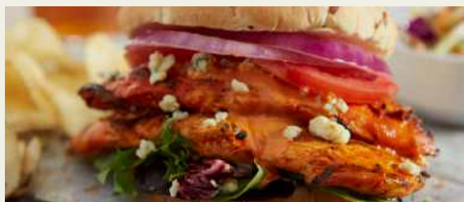
Frank's RedHot® Buffalo Chicken Sandwich

Cholula® has been made in Mexico for over 100 years and is named after the oldest inhabited city in the country. Our complex flavour comes from a family recipe that has been handed down through many generations, blending fresh, native arbol and piquin peppers with an array of regional spices.