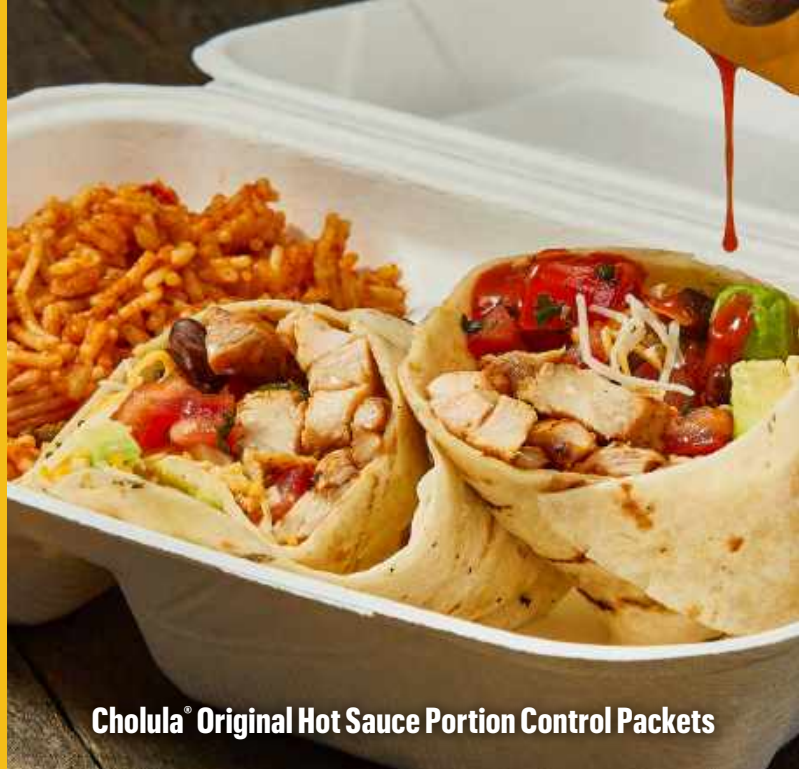
Cholula® Original Hot Sauce Portion Control Packets

Cholula® has been made in Mexico since its inception, and is named after the oldest inhabited city in the country. Our complex flavour comes from a family recipe that has been handed down through many generations, blending native arbol and piquin peppers with an array of regional spices.