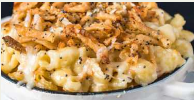
Everything Mac & Cheese

Molasses, anchovies and signature spices deliver a bold, tangy flavour and high-quality consistency. The 3.78 L plastic jug is recipe-ready for back of house.