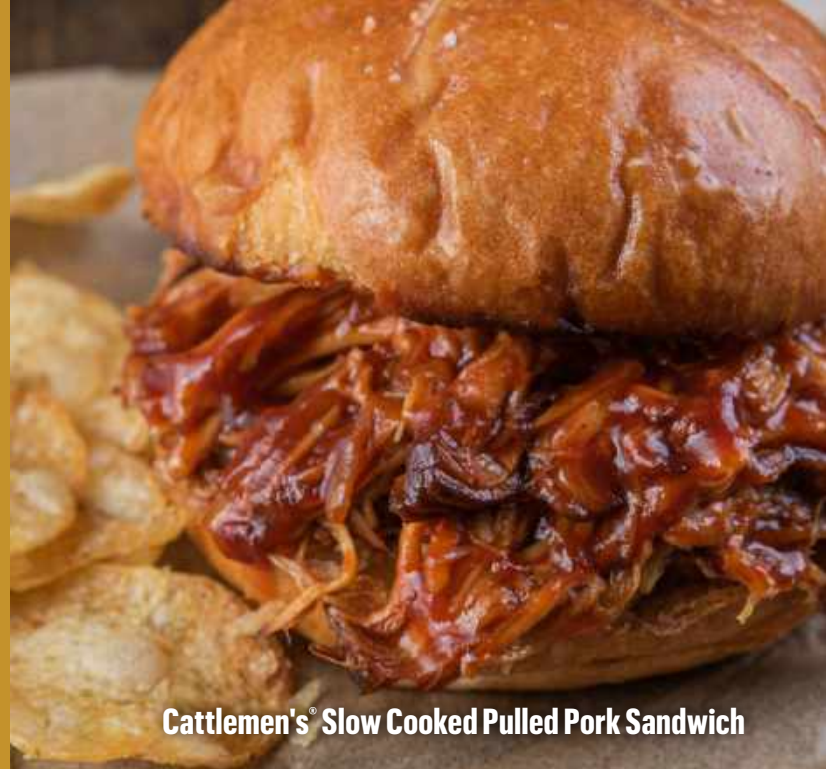
Cattlemen's® Slow Cooked Pulled Pork Sandwich