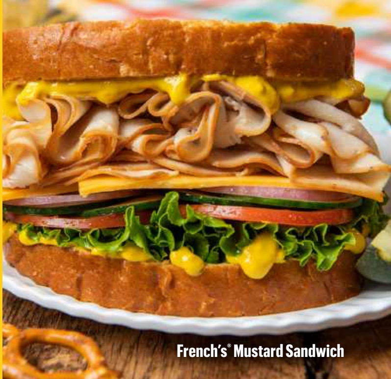
French's® Mustard Sandwich

We believe that great-tasting products begin with quality ingredients and a commitment to excellence. That's been our promise since we first introduced French's® Classic Yellow® Mustard in 1904. French's® is the Gold standard category leader in mustard for over 100 years. Expand your menu with French's® to excite your guests.