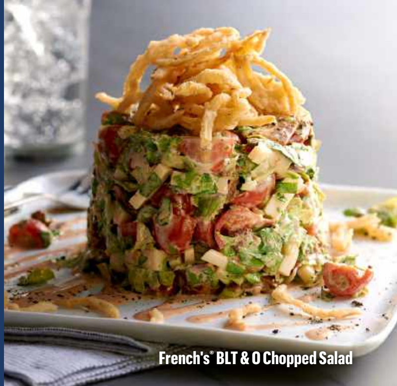
French's® BLT & O Chopped Salad

Does your menu need a little oomph? With French's® Crispy Fried Onions and Worcestershire Sauce you can add bold flavour and craveable texture to both traditional dishes and new applications. And with a name like French's®, you're guaranteed consistent, high-quality flavour dish after dish.