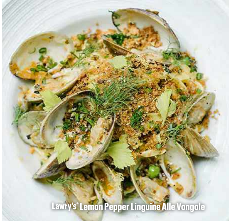
Lawry's® Lemon Pepper Linguine Alle Vongole

Lawry's® is restaurant-proven flavour featuring a high-quality selection of unique rubs, mixes, and seasoning blends sure to inspire. Our portfolio delivers the flavour, versatility, and convenience for a wide variety of menu needs.