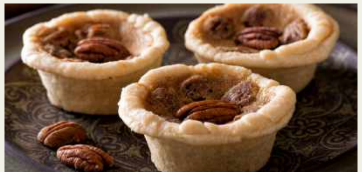
Honey Raisin Butter Tarts

Honey is a sweet food made by bees using nectar from flowers. Since it is pure, it has no other ingredients added and is more nutritious than refined sugar.