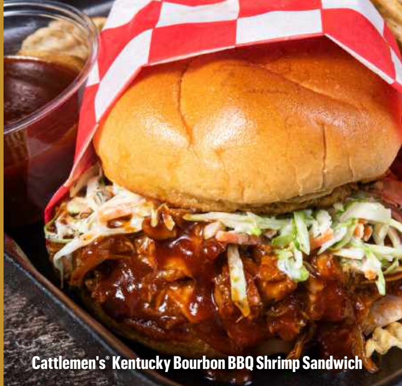
Cattleman's® Kentucky Bourbon BBQ Shrimp Sandwich

The world-class flavour standards and performance of Cattleman's® BBQ Sauce is unmatched. Our family of signature regional BBQ sauces is designed with a thick tomato base for ultimate slatherability, will cling to any protein, and won't break under high temps – saving you time on the back end.