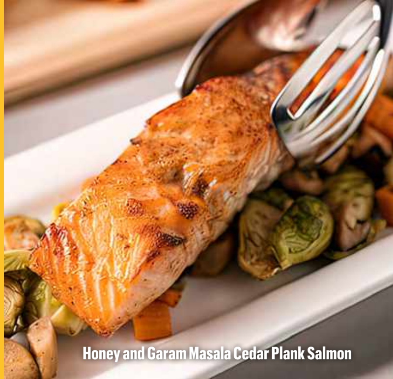
Honey and Garam Masala Cedar Plank Salmon

As Canada's favourite honey, Billy Bee is proud to offer a line of products that is 100% Canadian, fully sourced from Canadian beekeepers. Billy Bee Honey is a natural way to add sweetness to many foods and beverages and is available in a wide variety of food service sizes.