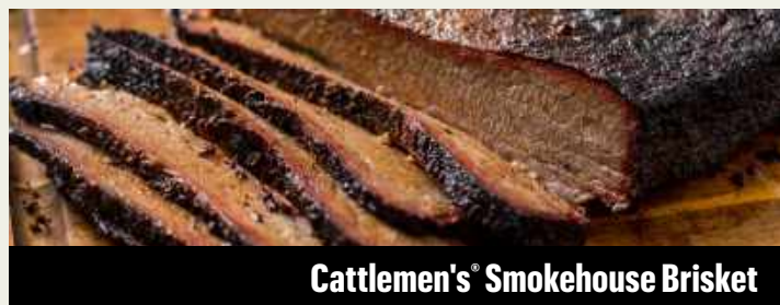
Cattlemen's® Smokehouse Brisket

A peppery blend of real sea salt, garlic and smoked paprika. Perfectly suited for beef, pork or grilled veggies. The coarse grind is great for open flame cooking.