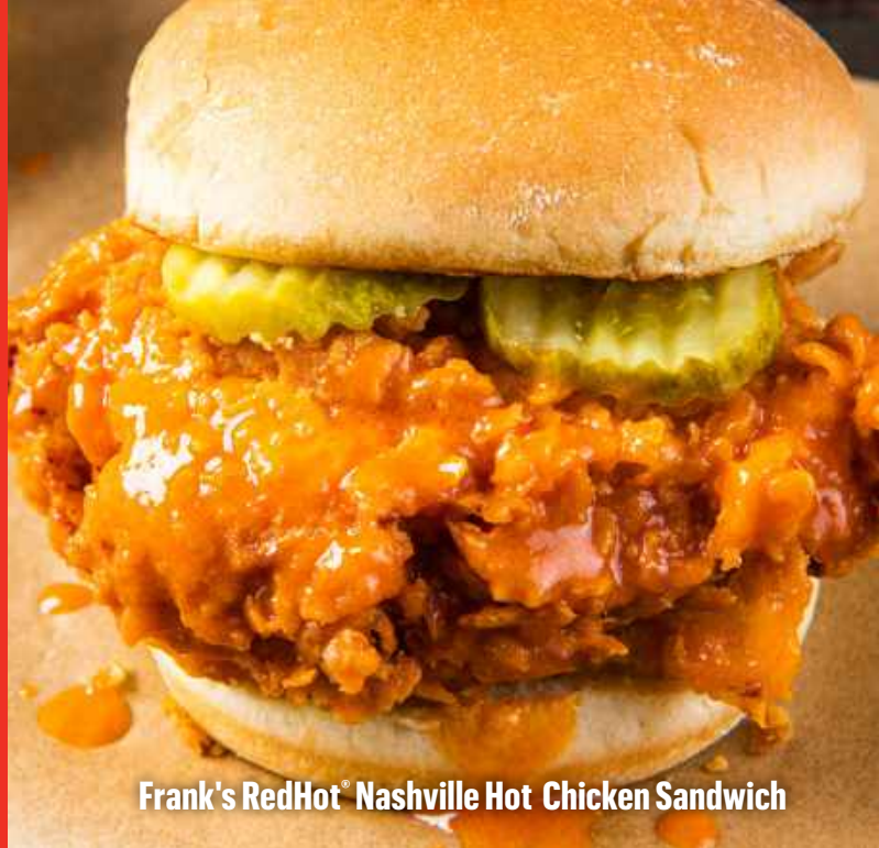
Frank's RedHot® Nashville Hot Chicken Sandwich