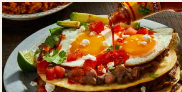
Cholula® Huevos Rancheros

Cholula® Sweet Habanero features a perfect balance of pineapple and habanero peppers for an unexpected kick of sweet heat.