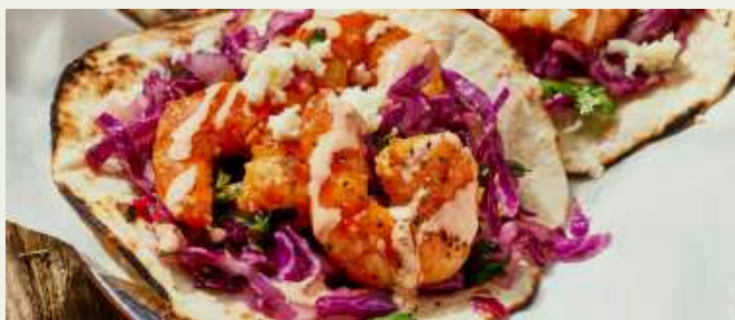
Cholula® Shrimp Tacos

Why choose just one hot sauce? Here's the answer – you don't have to! With the widest variety of hot sauce flavours in foodservice, McCormick can empower you to own popular and authentic spicy flavour profiles that please guests with different taste preferences.