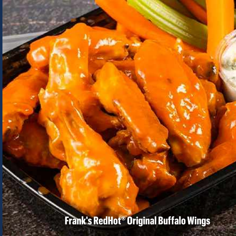
Frank's RedHot® Original Buffalo Wings

Consumers crave spicy flavour! Can your menu handle the heat? With flavour profiles ranging from spicy and smoky to mild and sweet, McCormick is home to the hot sauce brands your patrons love and ask for by name.