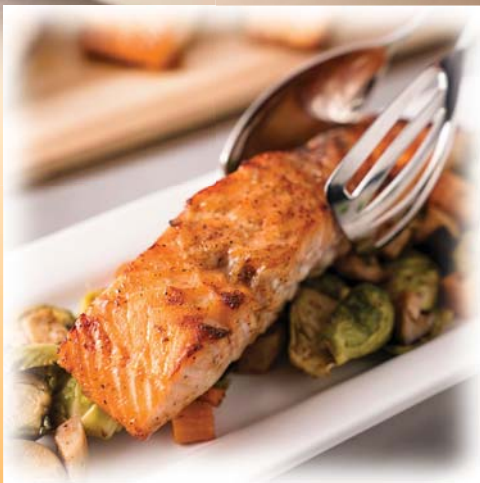
Billy Bee Honey and Garam Masala Cedar Plank Salmon with Roasted Brussels Sprouts & Carrots