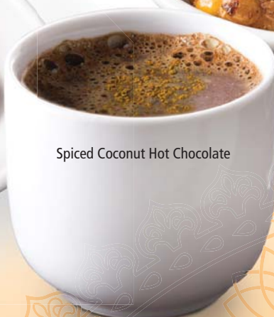
Spiced Coconut Hot Chocolate