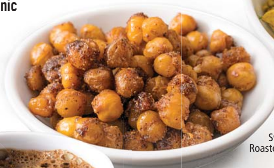
Sweet & Spicy Roasted Chickpeas