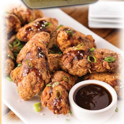
Crispy Spicy Tamarind Chicken Wings