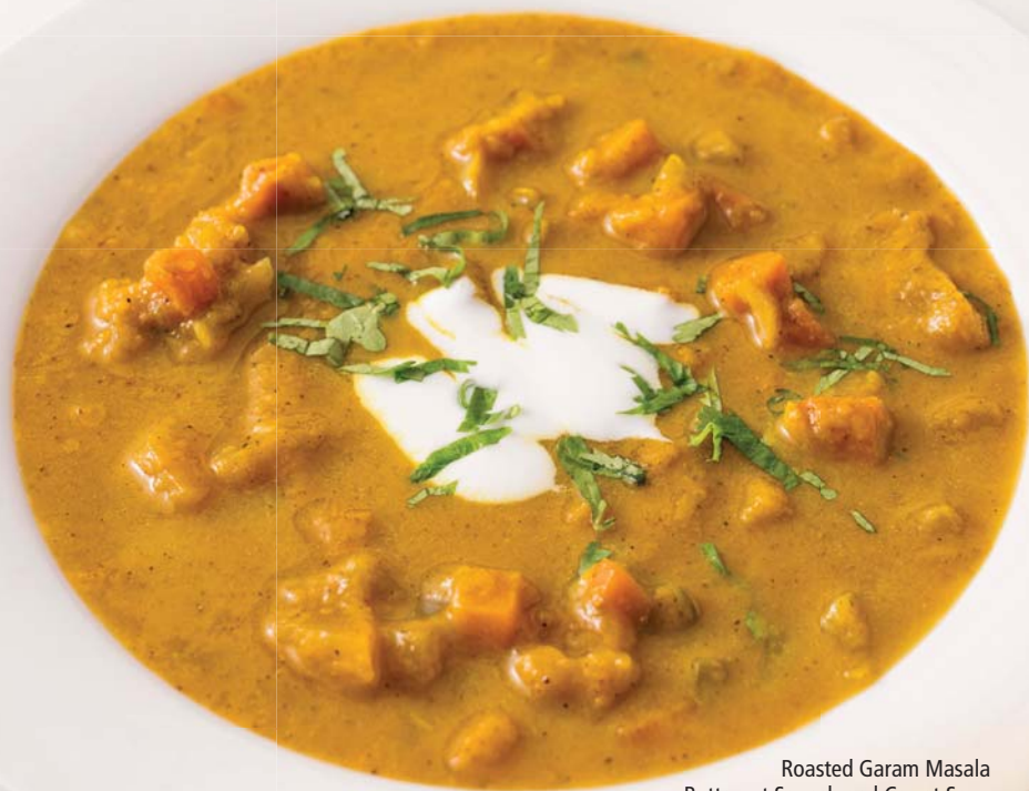
Roasted Garam Masala Butternut Squash and Carrot Soup