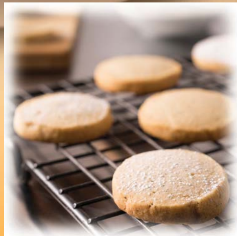
Spiced Brown Sugar Shortbread Cookies